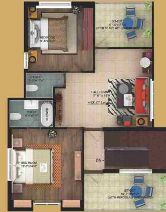
3 BHK _ FIRST FLOOR PLAN

3 Bedrooms + Drawing + Living + Kitchen + Dining + Family Lounge + Sit - Out