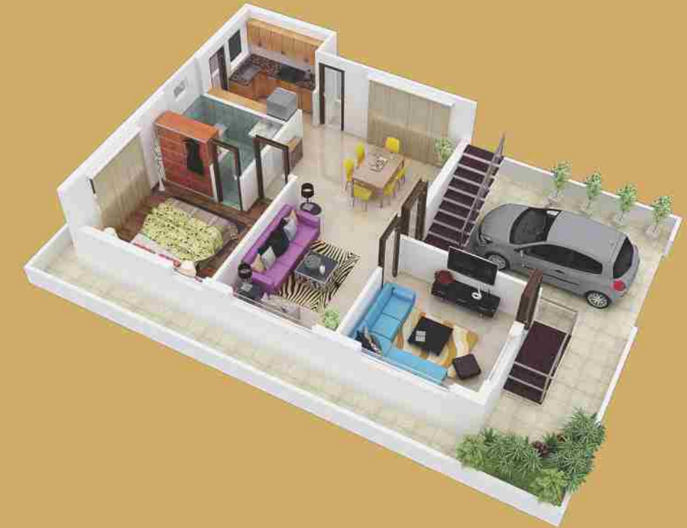
3 BHK _ GROUND FLOOR 3D PLAN