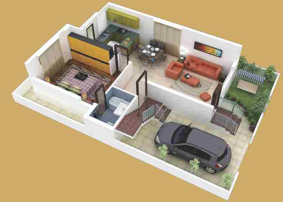
2 BHK _ GROUND FLOOR 3D PLAN