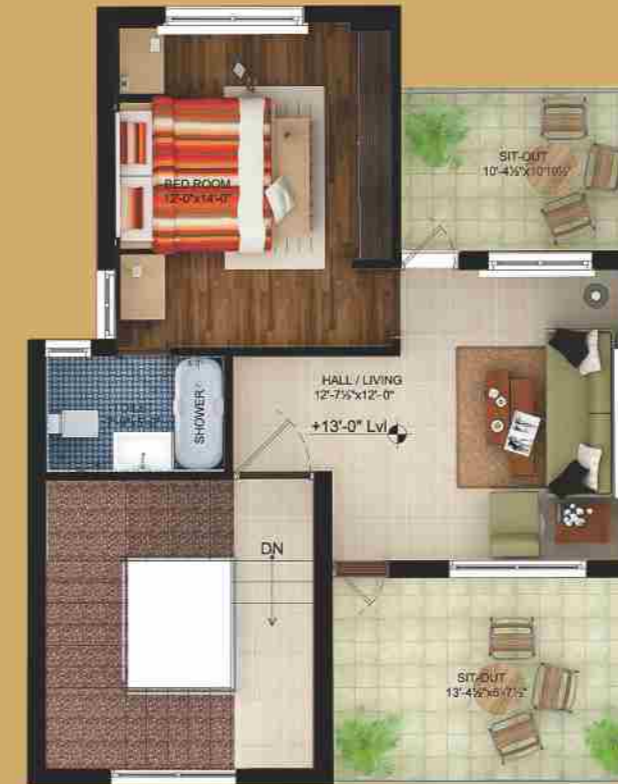
2 BHK _ FIRST FLOOR PLAN

2 Bedrooms + Drawing + Living + Kitchen + Dining + Family Lounge + Sit - Out