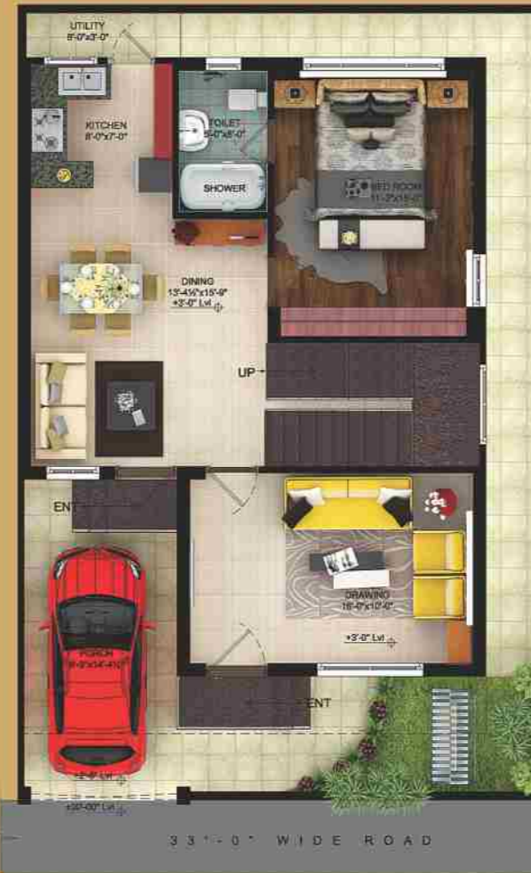
3 BHK _ GROUND FLOOR PLAN