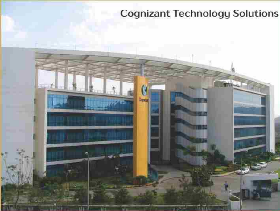
Cognizant Technology Solutions