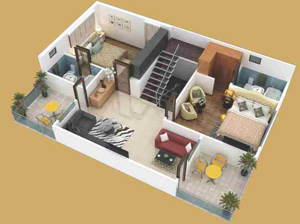
3 BHK _ FIRST FLOOR 3D PLAN