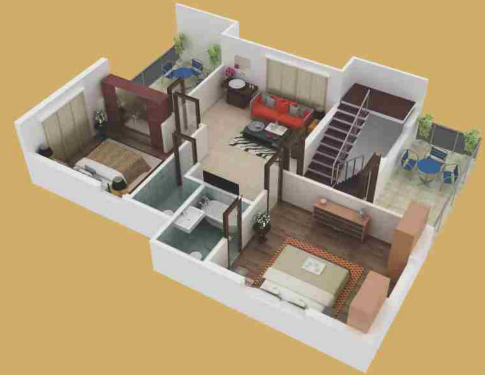
3 BHK _ FIRST FLOOR 3D PLAN