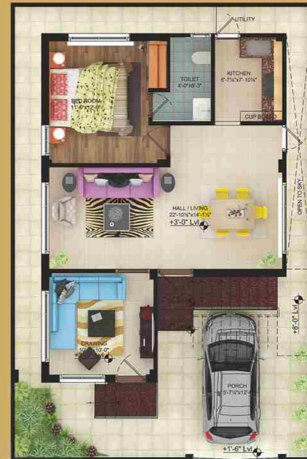
3 BHK _ GROUND FLOOR PLAN