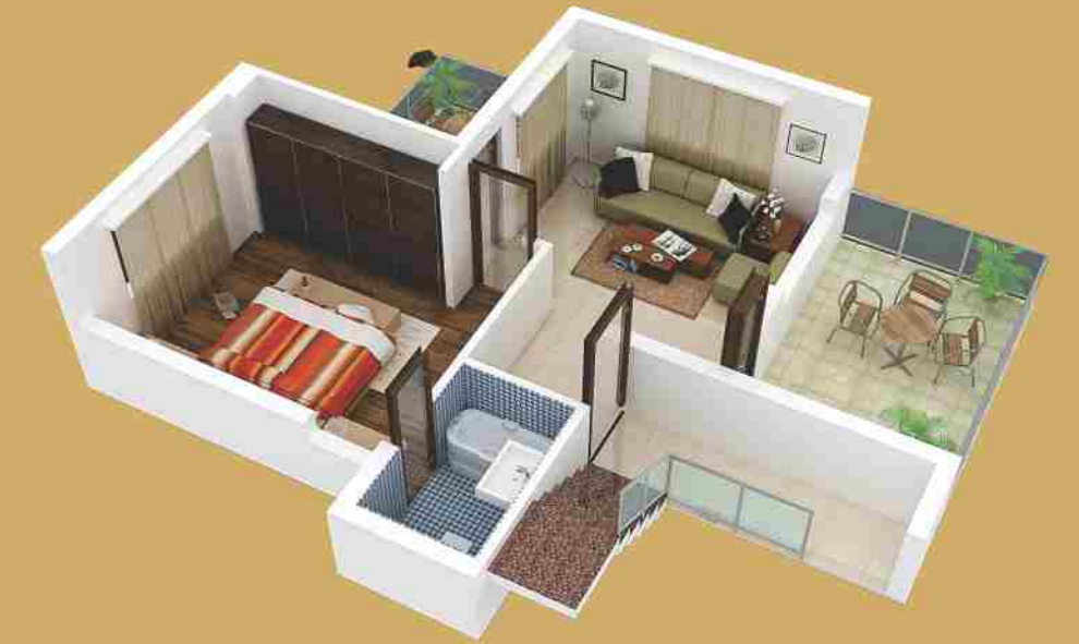
2 BHK _ FIRST FLOOR 3D PLAN