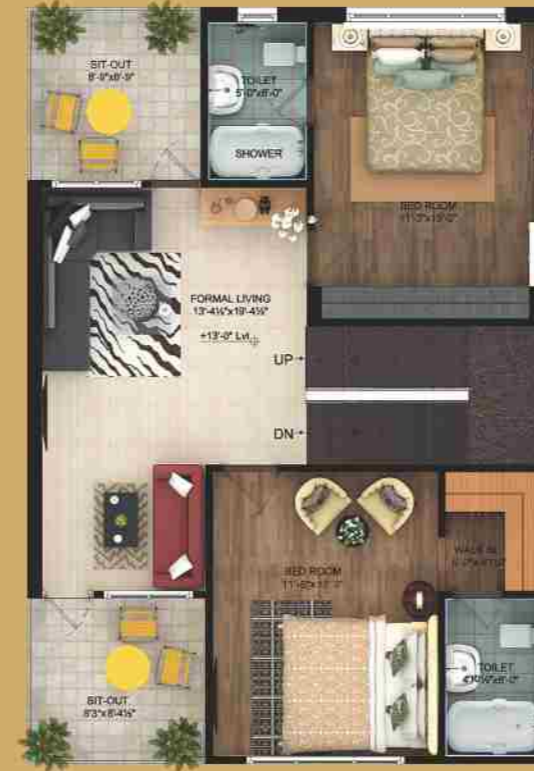
3 BHK _ FIRST FLOOR PLAN

3 Bedrooms + Formal Living + Living + Kitchen + Dining + Family Lounge + Sit - Out