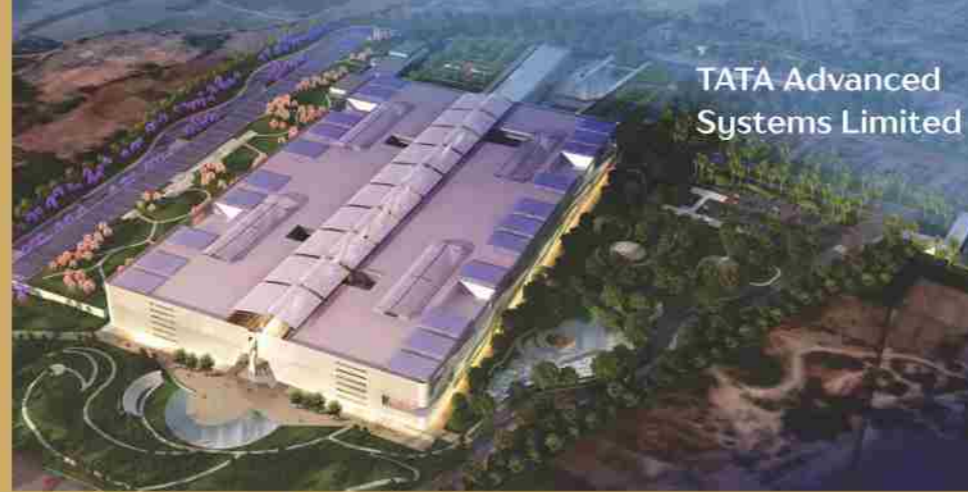
TATA Advanced Systems Limited