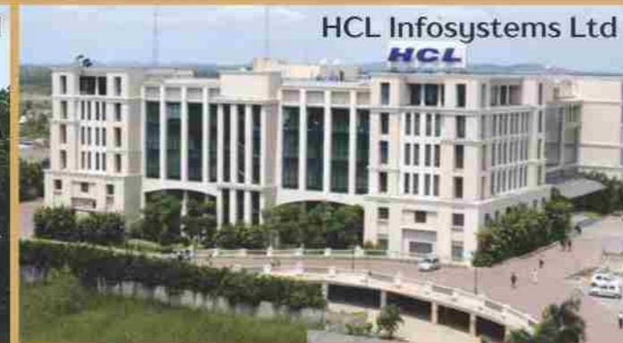
HCL Infosystems Ltd