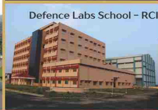
Defence Labs School - RCI