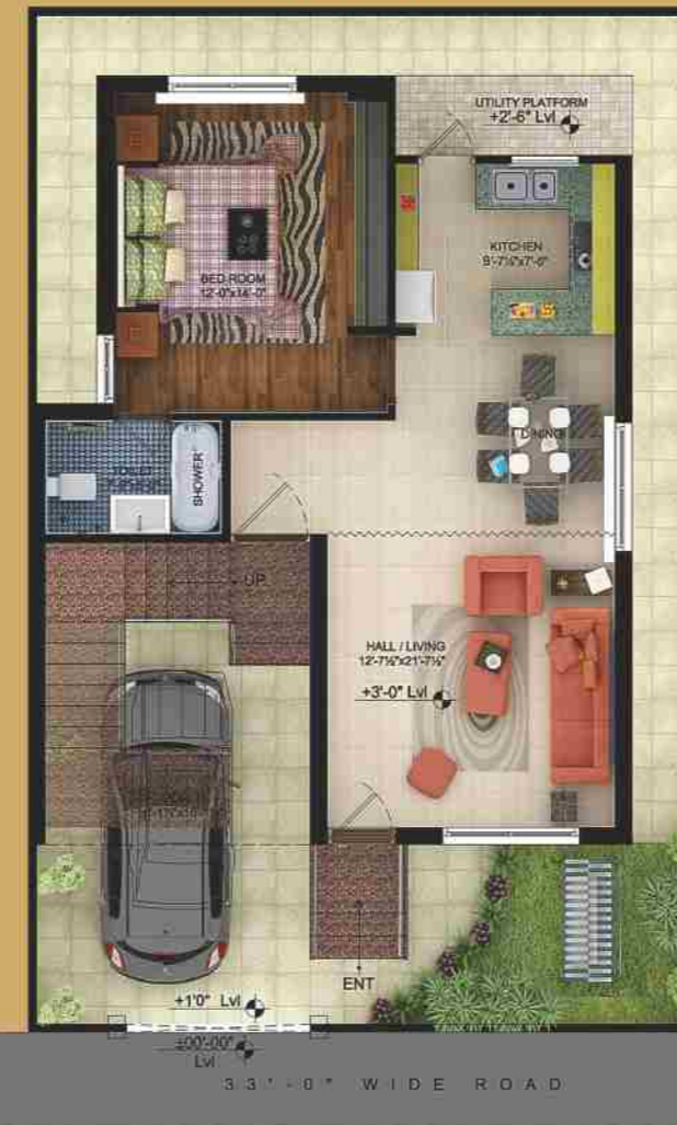
2 BHK _ GROUND FLOOR PLAN