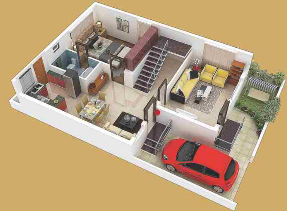
3 BHK _ GROUND FLOOR 3D PLAN